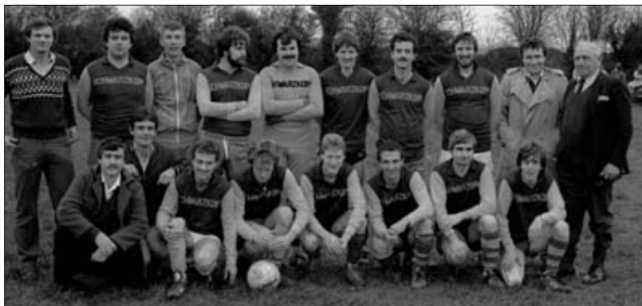
Carrigtwohill United 1983