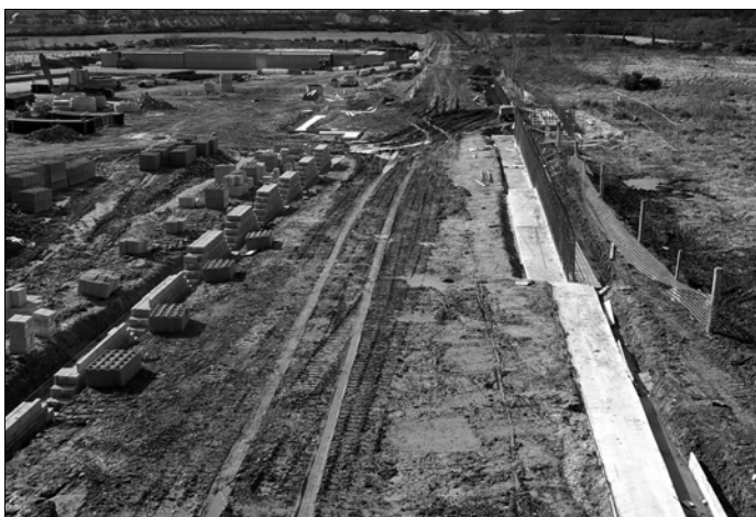
Railway Station, Carrigwohill